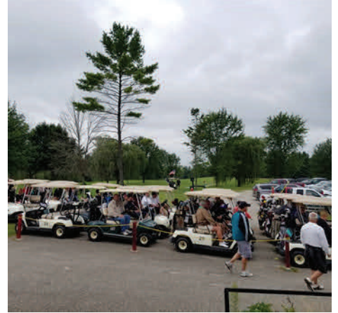
Ready, Set, Go!