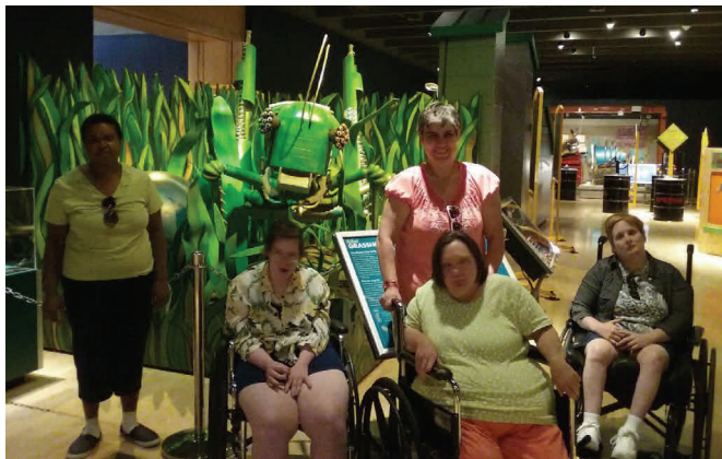
A visit to the Robotics Zoo in Grand Rapids on June 11th.

The Grand Ledge women visited the Robotics Zoo in Grand Rapids on June 11th.