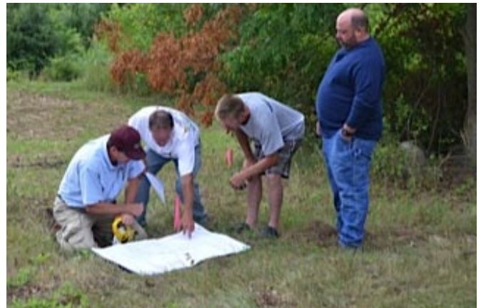
Let the games begin!